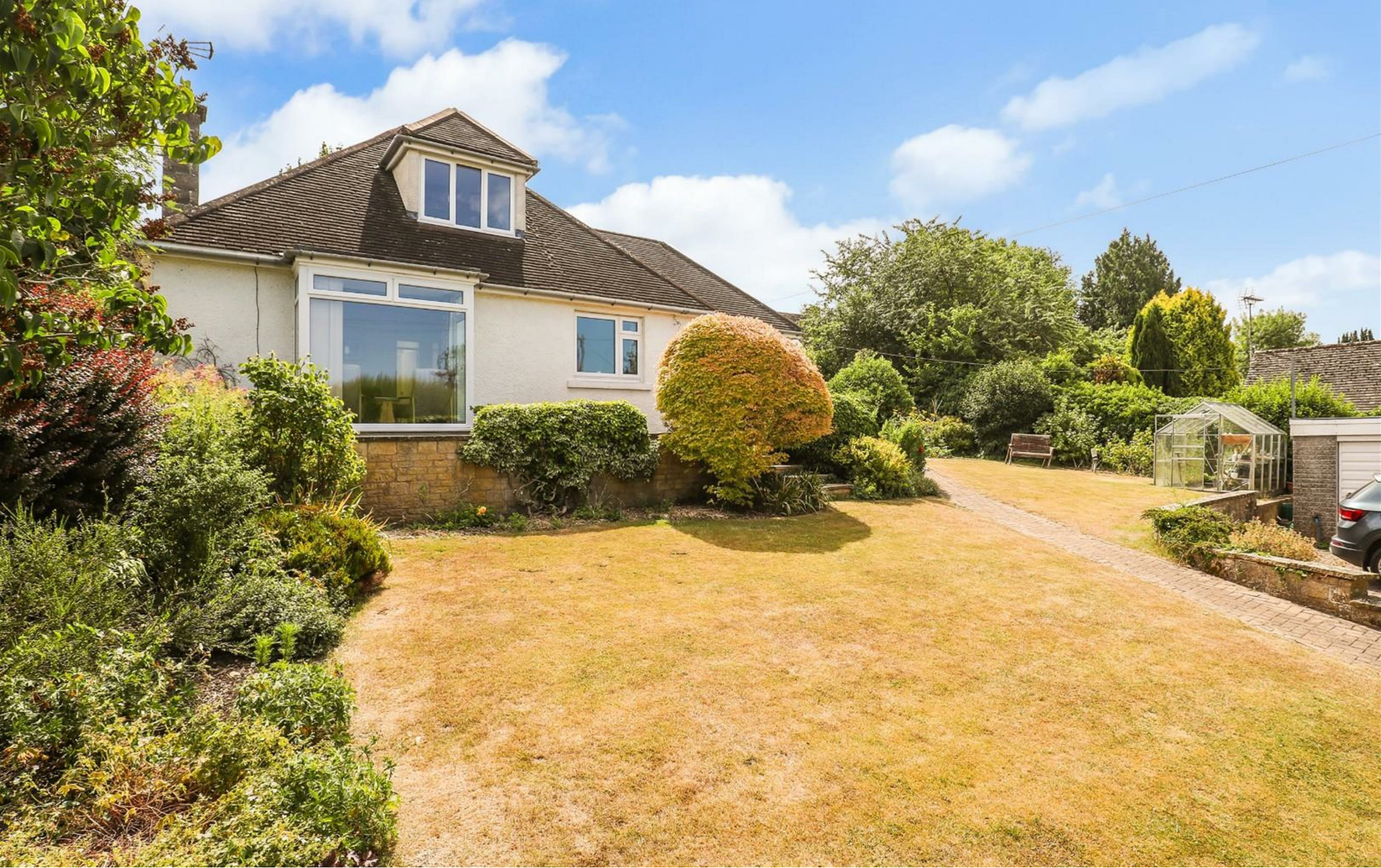
FIRLE COTTAGE · BLAKEWELL MEAD · PAINSWICK